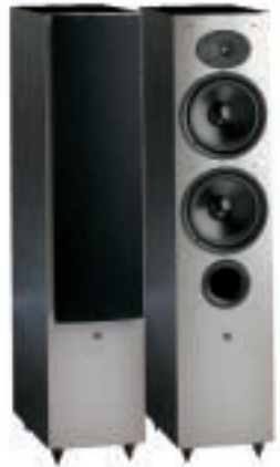
AS-F2 Floorstanding Speakers